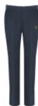
Chace Trousers Compulsory with Logo From £20.95