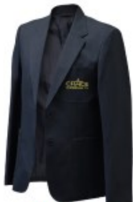
Chace Blazer 40% Recycled Fabric From £34.95