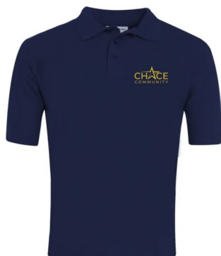
*Chace Community Polo Shirt *Optional: for the summer term only From £11-95