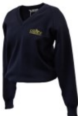
Chace Jumper 40% Recycled Fabric From £21.95