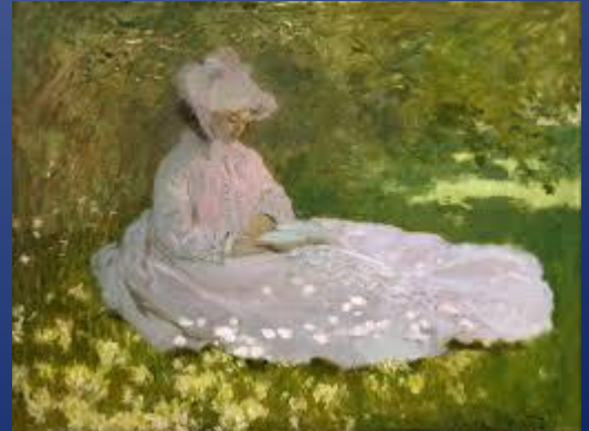
Springtime 1872 Claude Monet