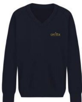
Magic Fit Navy Jumper Ring spun combed cotton and acrylic fibres | durable