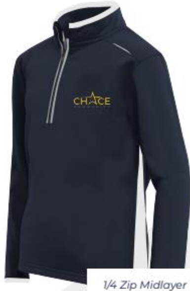
1/4 Zip Midlayer