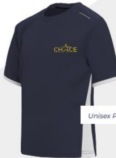
Unisex PE T-Shirt