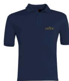
Summer Polo Shirt 65% Polyester/ 35% Cotton | 210 GSM Heavyweight | Soft & durable low pill fabric