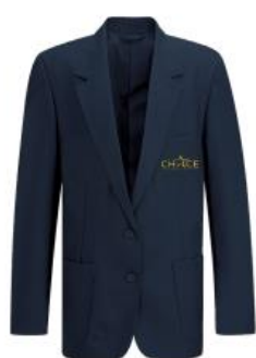
Ziggys Navy Blazer Three patch pockets | Internal zip pockets | Maxtech® Plus stain resistance | 100% woven Polyester