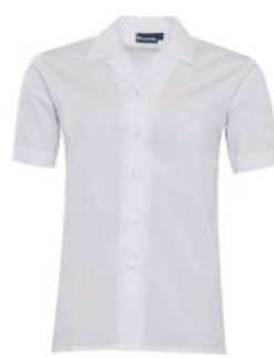
L/S Sleeve Revere Shirts Non-iron | Machine washable | Twin pack | 65% recycled polyester