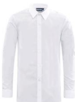
L/S Sleeve Shirts Non-iron | Machine washable | Twin pack | Unisex | 65% recycled polyester