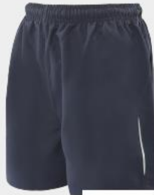
Unisex PE Shorts