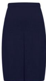
Banner Navy Thornton Skirt A-Line skirt | zip/button fastening | Maxtech® Plus stain resistance | 65% Polyester/35% Viscose twill