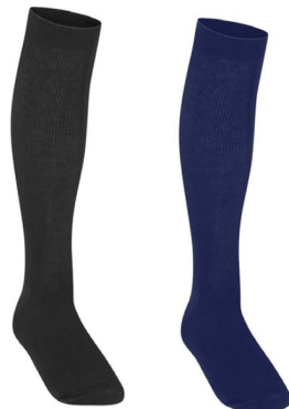
Navy or Black Knee High Socks (3 Pack) £10.95