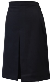
Chace Community Skirt 65% polyester/35% viscose From £22.95