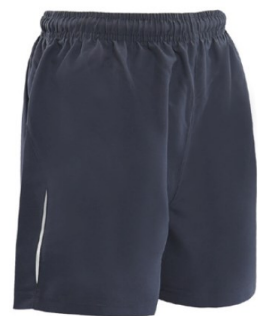
Chace Unisex Shorts From £11.95