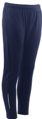
Chace Unisex Joggers Brushed Fleece Inner From £16.95