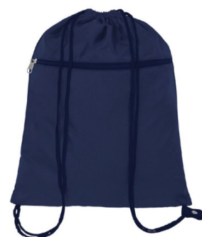
Navy Premium PE Bag Drawstring and Zip Design £6.95