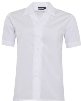
Long/Short Revere Shirts (Twin Pack) From £13.50