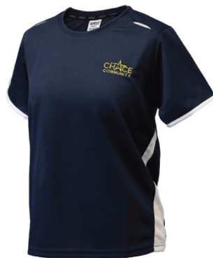
Chace Unisex PE T-Shirt ProActive 100% Airmesh From £13.95