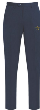
Chace Fitted Trousers Compulsory with Logo From £20.95