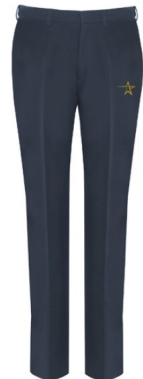
Chace Trousers Compulsory with Logo From £20.95