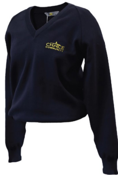
Chace Jumper 40% Recycled Fabric From £21.95