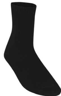
Black Ankle Socks 5 Pack £7.95