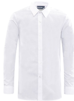
Long/Short Sleeve Shirts (Twin Pack) Wear with Tie From £13.50