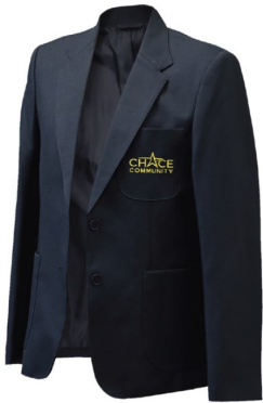
Chace Blazer 40% Recycled Fabric From £34.95