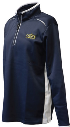
Chace 1/4 Zip Midlayer Fleece Internal From £22.95