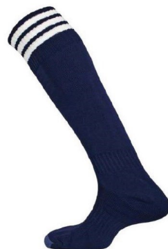
Navy/White Stripe Football Socks Three Stripe Design From £5.50