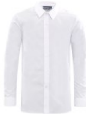
Long/Short Sleeve Shirts (Twin Pack) Wear with Tie From £13.50