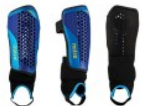
Shinpad Ankle £11.95