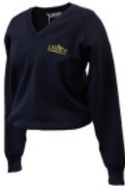
Chace Jumper 40% Recycled Fabric From £21.95