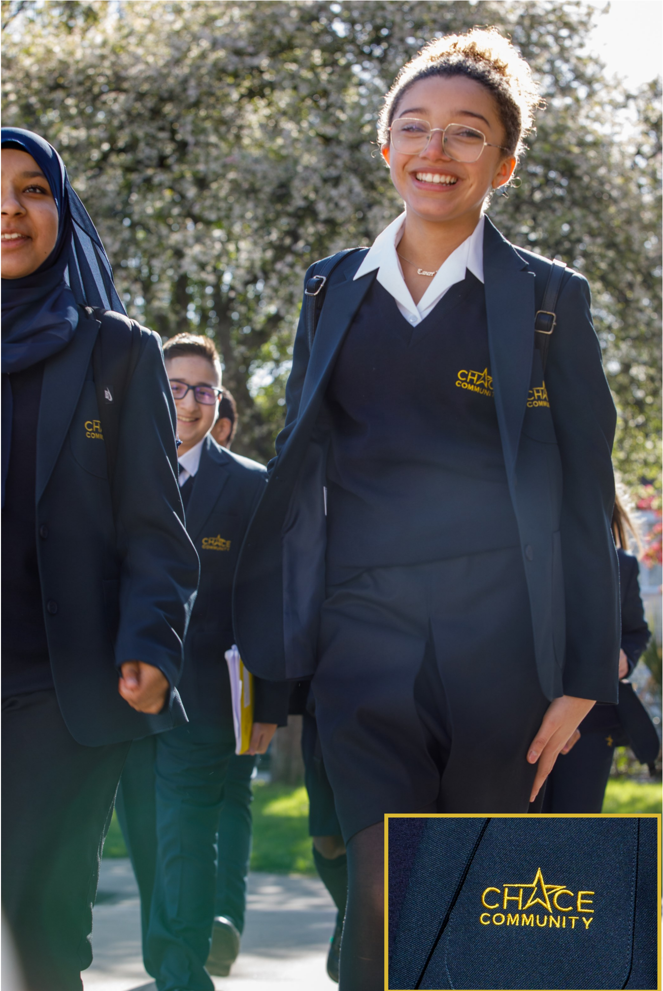
Excellence has no limits