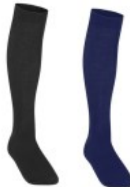
Navy or Black Knee High Socks (3 Pack) £10.95