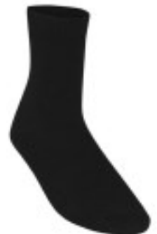
Black Ankle Socks 5 Pack £7.95