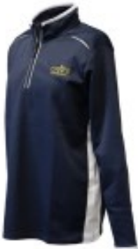
Chace 1/4 Zip Midlayer Fleece Internal From £22.95