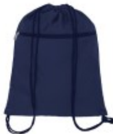
Navy Premium PE Bag Drawstring and Zip Design £6.95