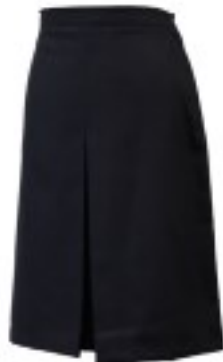
Chace Community Skirt 65% polyester/35% viscose From £22.95