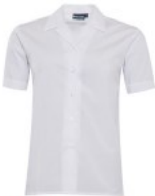
Long/Short Revere Shirts (Twin Pack) From £13.50