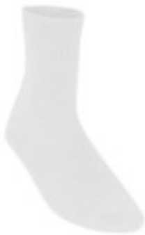
White Ankle Socks 5 Pack £7.95