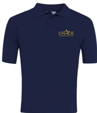
*Chace Community Polo Shirt *Optional: for the summer term only From £11-95