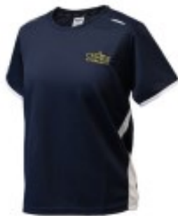
Chace Unisex PE T-Shirt ProActive 100% Airmesh From £13.95