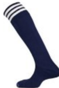
Navy/White Stripe Football Socks Three Stripe Design From £5.50