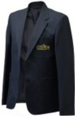
Chace Blazer 40% Recycled Fabric From £34.95