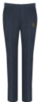
Chace Trousers Compulsory with Logo From £20.95