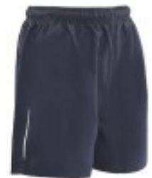
Chace Unisex Shorts From £11.95